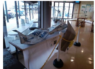
Road sign damaged by Tsunami

At “Station of the road Soma” located in Soma city, a corner about road info post disaster was created. Statistics regarding the disaster damages and pictures taken before the disaster were displayed. Moreover, the damages done to the road signs, clocks, tables and some deformed bridge devices were being displayed as well. It shows the damaging power of the earthquake in 2011.