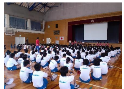
Fukushima city Omori elementary Interaction with local Grade 5 and 6 students

This year, 10 youth came to Fukushima for home stay. They visited schools and had discussions with the local youth. The local students had a wonderful time playing games in English and sing the songs with the Thai youth.